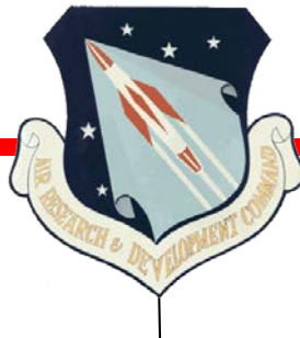
Air Research & Development Command 1950