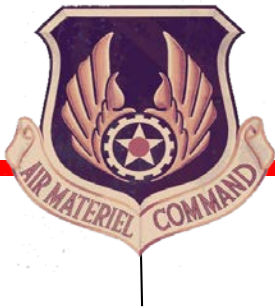
Air Materiel Command 1946